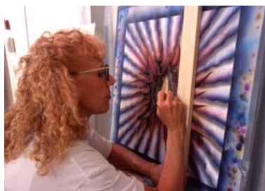
Judy Chicago working

Jurying and judging are two necessary elements of a good show, but what is the difference?