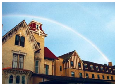
Dole Mansion at Lakeside Legacy Arts Park

The Lakeside Legacy Arts Park was established in 2004 as a creative use for the Dole Mansion and Lakeside property. This was a result of our grass roots effort to save the mansion and surrounding 12 acres from development. Once the property was initially saved, we