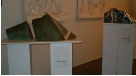
Bronze Sculptures—Thomm Beggs Woodstock City Hall

Businesses are you looking for an inexpensive way to spiff up the office? Give the lobby a new look? Why not participate in naac 's Art On Loan Program?