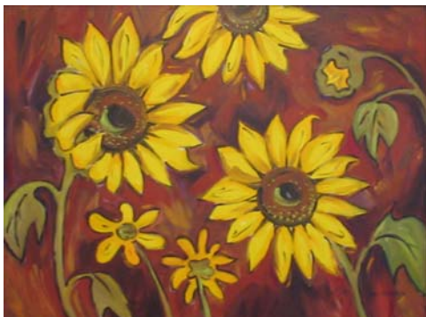
Sunflowers by Jurgita Mekyte

(see the article on page 12 for more details on the open board meetings).